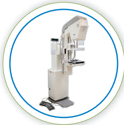
Mammography (Analog & Digital)