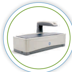
Dexa Scanner (BMD)