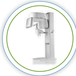
OPG and Dental X-ray