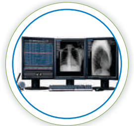
PACS and DICOM Software / Workstations