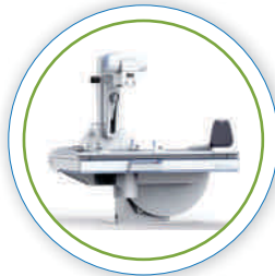
Radiography / Fluoroscopy X-ray Equipment